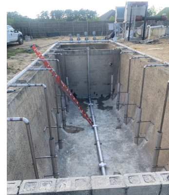
Digester where we fabricated a new aeration system at a WWTP in Louisiana.

While the group is still in its infancy, they are already seeing the success of such business - knocking out work orders and opening the doors to future work. Such projects they have completed include: Digester Piping Upgrade, 2” Water Main Extension, CCTV work, and Upgrade of 15 Lift Stations.