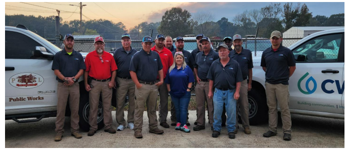
The new CWS team in Petal, MS

Congratulations to each of the winners! Enjoy spending those gift cards!